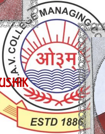
ANIRUDH KAUSHIK 96.40%